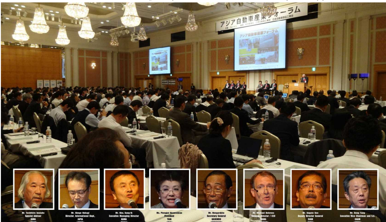
Asia Automotive Industry Forum (November 8, 2013, Nagoya, Japan)

FOURIN, Inc. has been working closely with the Asian automotive industry for many years.